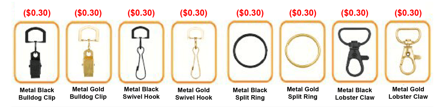
Newly Arrived Clip Attachment(Price On a P)

Gold & Black Metal Clip Attachment(Price On a P)