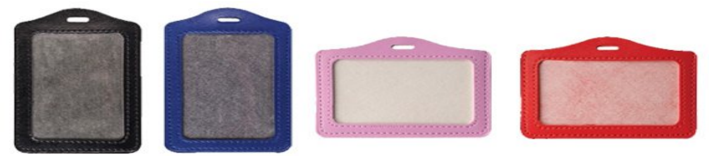
Vertical Size -2 4/5 inch W x 4 2/5 inch H

Horizontal Size -4 2/5 inch W x 2 4/5 inch H