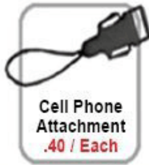
Cell Phone Attachment