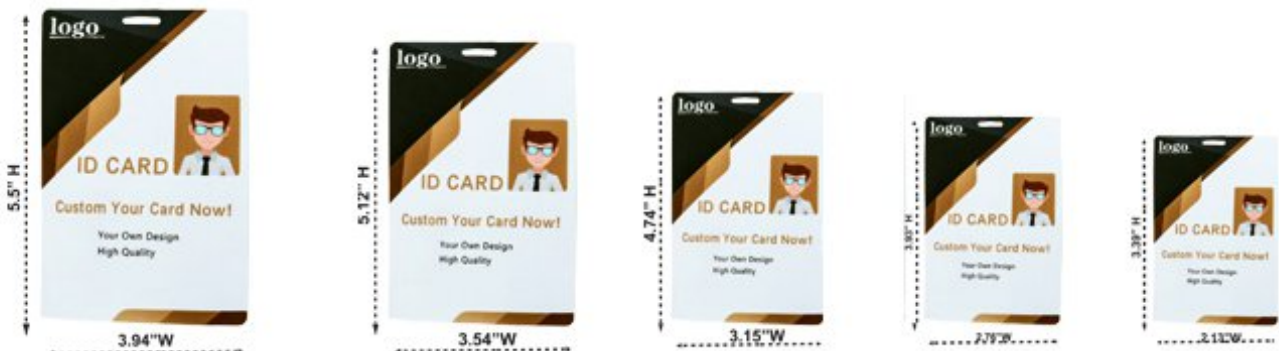
5.5" H 3.94" W