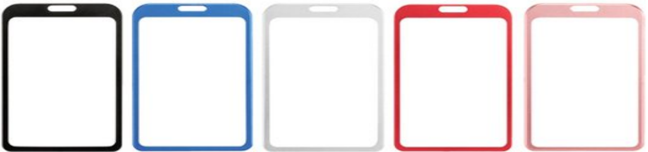
Holder Size - 2 1/4 inch x 3 3/4 inch