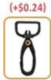
Plastic Oval Hook