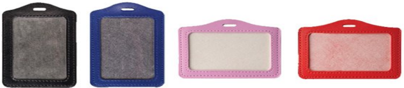
Vertical Size - 2 4/5 inch W x 4 2/5 inch H