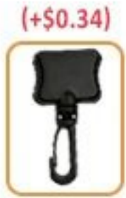
Plastic Swivel Hook