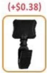
Plastic Bulldog Clip