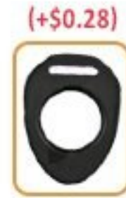
Plastic Canteen Clip