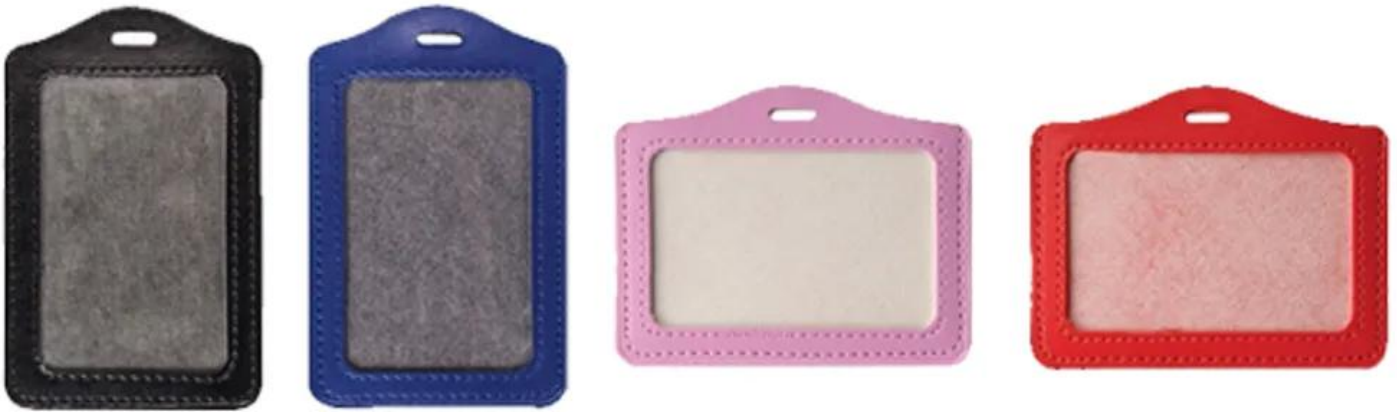
Vertical Size - 2 4/5 inch W x 4 2/5 inch H