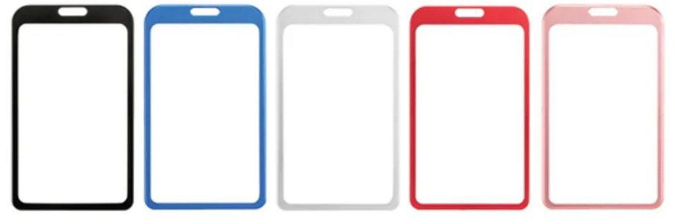
Holder Size - 2 1/4 inch x 3 3/4 inch