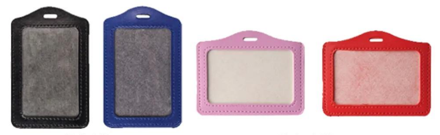
Vertical Size -2 4/5 inch W x 4 2/5 inch H